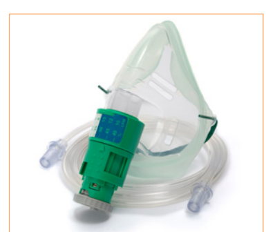
Oxygen and Aerosol Therapy • Fixed Oxygen Concentration (High Flow)