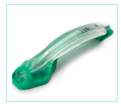
Airway Management • Airway Devices